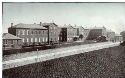
New Orphan House, No. 3.