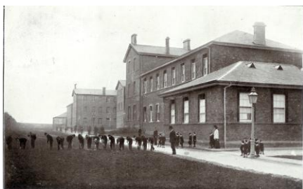
Orphanage House Number 4 – 450 children Opened in 1868