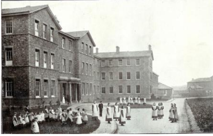
House Number 5 – 450 children Opened in 1870

Fifty years after Mr. Mueller began his work, at least one hundred thousand orphans were cared for in England alone.