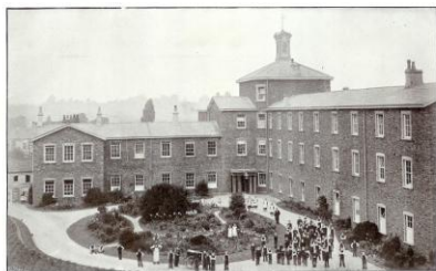
New Orphan House, No. 1.