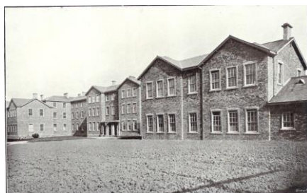
Orphanage House Number 2 – 400 children Opened on November 12, 1857